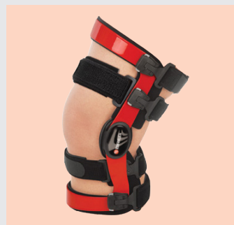
Z-12 ® D