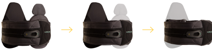
Horizon 639 LSO

The Horizon 639 LSO easily steps down to a Horizon 631 LSO and to a Horizon PRO (Pain Relief Orthosis), the lowest-profile option to help manage recurring back pain as needed.